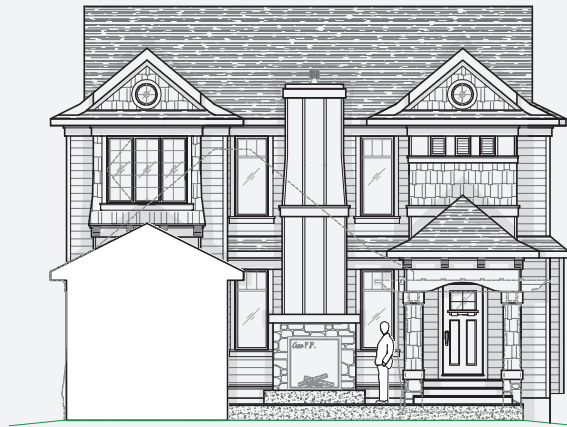
COURTYARD FRONT ELEVATION