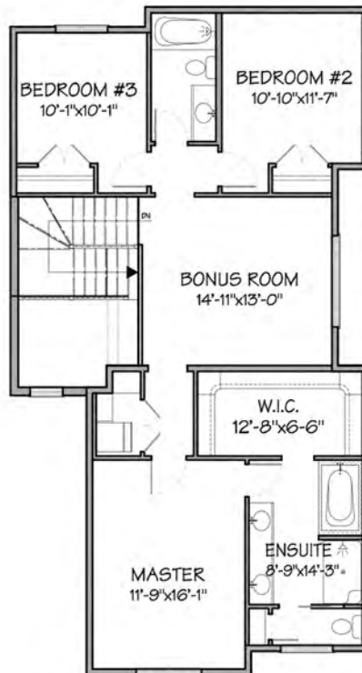
UPPER LEVEL FLOOR PLAN 1,075 FT 2