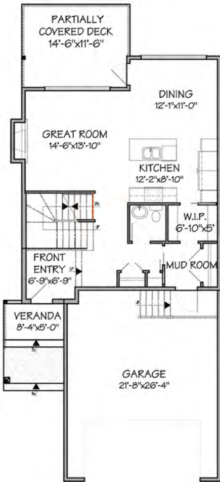
MAIN LEVEL FLOOR PLAN 840 FT 2