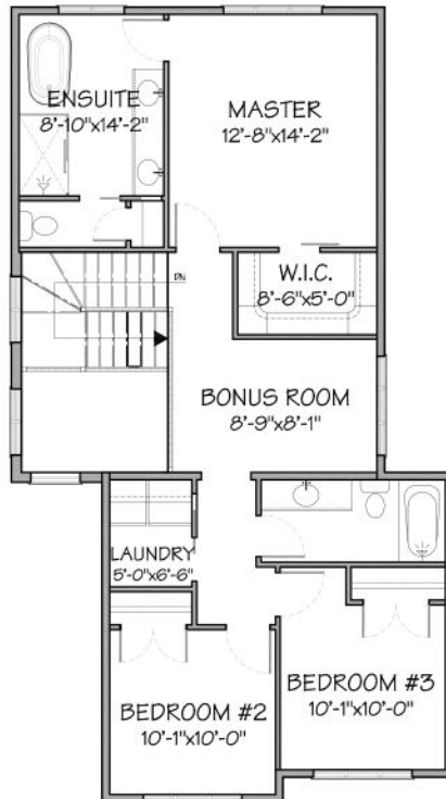
UPPER LEVEL FLOOR PLAN 924 FT 2