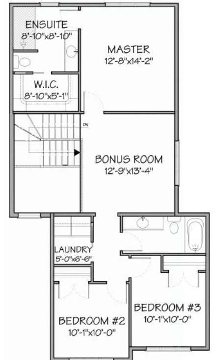
OPTIONAL UPPER FLOOR PLAN