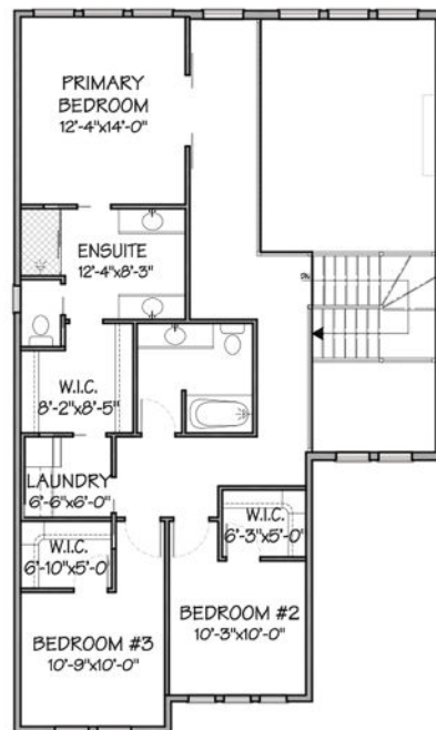
UPPER LEVEL FLOOR PLAN 1,099 sq. ft.