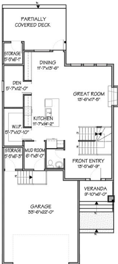
MAIN LEVEL FLOOR PLAN 1,033 sq. ft.