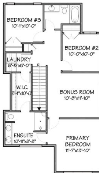
UPPER LEVEL FLOOR PLAN 970 sq. ft.