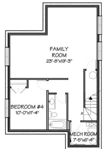
LOWER LEVEL 692 sq. ft. future dev.